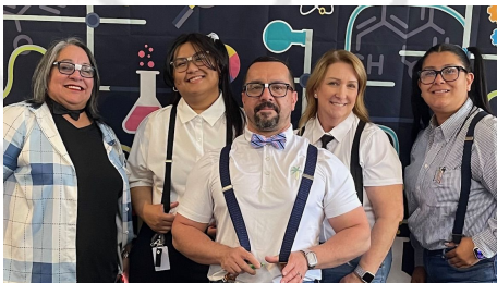
Themed Spirit Week involved residents and staff engaging in fun and challenging activities together. It was such a fun week!