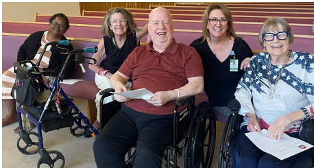
A few residents went to the Palm Springs International Piano Competition. What a treat it was to listen to such great talent from all over the world.