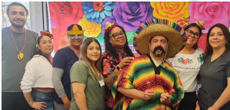
Cinco de Mayo